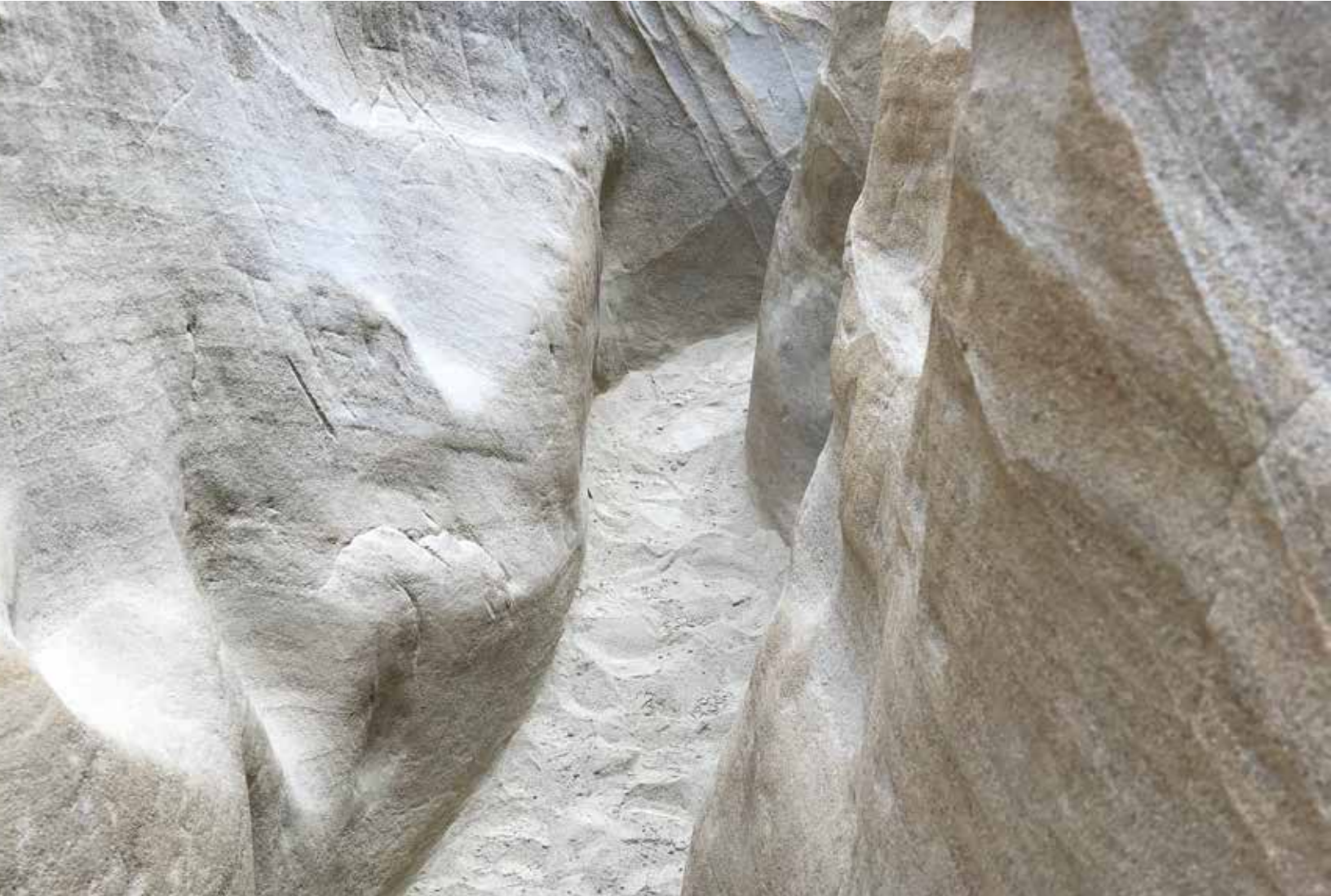
Annie's Canyon Trail, San Elijo Lagoon Ecological Reserve San Diego, CA