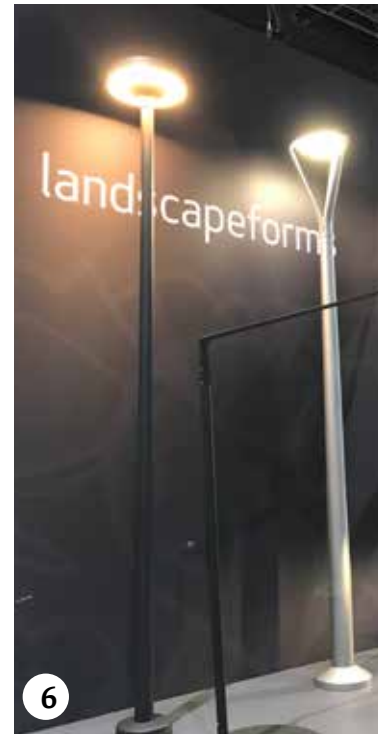
1. Early morning light on Martin Luther King Promenade 2. ASLA San 2019 @ the San Diego Convention Center 3. Wading pool and fountain at Waterfront Park 4. Field-Session to San Elijo Lagoon Nature Preserve 5. Custom play structure at the Earthscape Play booth. 6. Landscapeforms display of site and accent lighting. 7. Never far from home even in San Diego!